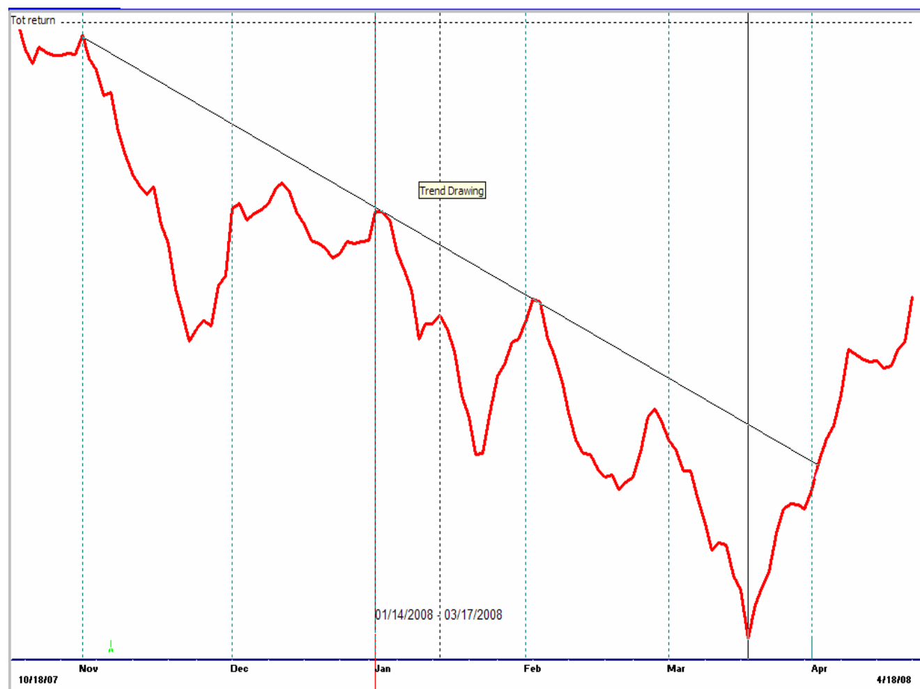
Chart 2 – High Yield Bond Index (Red Line) with trend line

High yield bonds, one of the types of securities that we use for the fixed income component of our allocations, have clearly been in a downtrend. This is why we have been in cash and not invested in the high yield bond market since mid-December. Our investment strategy in this area is to attempt to be invested during periods of positive trend, when the bonds are appreciating in value. When they are appreciating in value they provide a very nice return due to the price appreciation as well as the attractive interest rates they pay – sort of a double benefit. The interest rate on these bonds is now near 10%. As mentioned at the beginning of this newsletter we are re-entering the high yield mutual funds now for those portions of your allocation that may be allocated to bonds. The chart below shows the upside breakout that high yield bonds have experienced recently. Long time clients of HIM are aware of the valuable benefits that our investment management in the bond area has provided over the years.